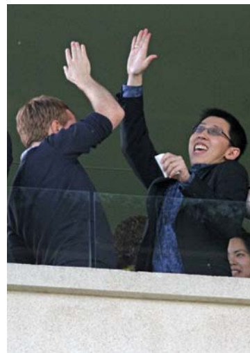
2011 Firm Day Out at Randwick Races, Sydney. Some very happy winners!